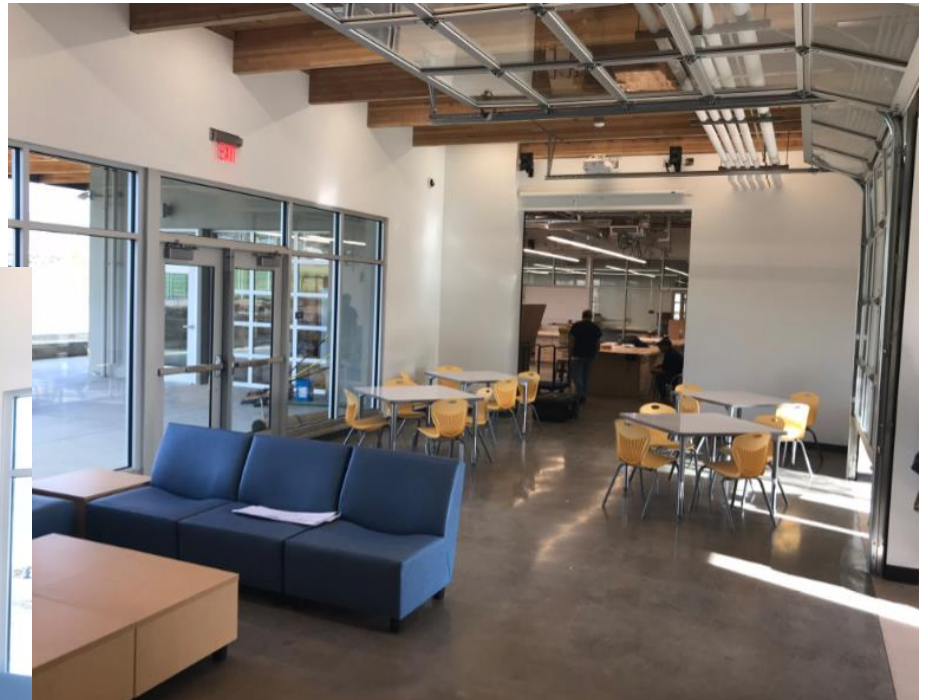
New Commons Area