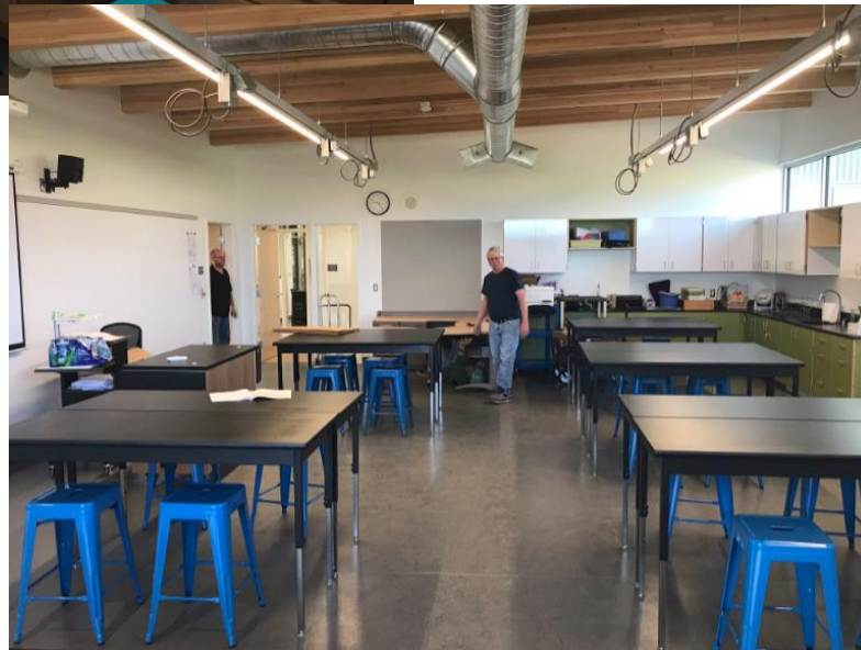
New Lab Space