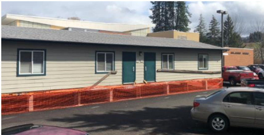
Modular from May Street Temporarily Stored at Mid-Valley Parking Lot. To be set this summer.